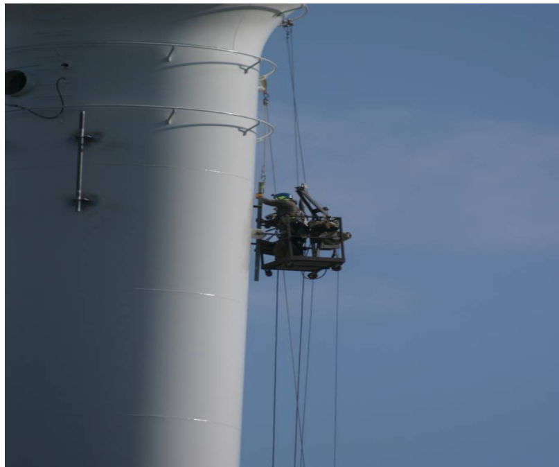
Workers welding antenna mounts to the stem of the water tank.